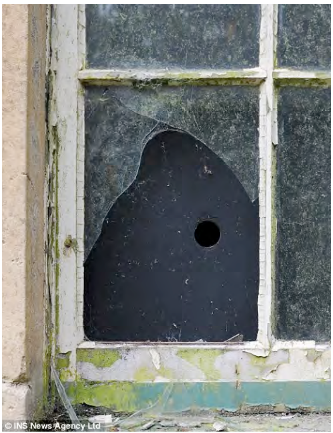
Sorry state: Windows are smashed and wood is rotting

Government and the last thing the public want to see is an empty house,' he explains.