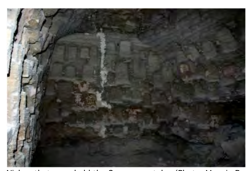
Niches that once held the Serapeum stelae.

"Among the great treasures of the Serapeum are the many stelae that were discovered within. These were dedicated by people who had come to visit the Serapeum, and they teach us much about the history of the monument, such as the names of the individuals associated with the burial of the bulls, as well as information about the lives of the bulls themselves. Today, the stelae have all been removed and taken to museums, leaving only small niches in the walls where they once could be found.