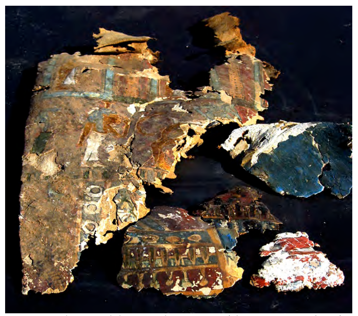
Cartonnage discovered during work at Saqqara.

"Dr. Zahi Hawass stated that the mission unearthed a large quantity of golden fragments during restoration work at the southern tomb of Djoser's pyramid. These may have been used by the ancient Egyptians of the Late Period to decorate wooden sarcophagi or to cover carttonage. Thirty granite blocks were also discovered, each weighing five tons. These blocks, Dr. Hawass explained, belonged to the granite sarcophagus that once housed Djoser's wooden sarcophagus - the final resting place of the king's mummy.