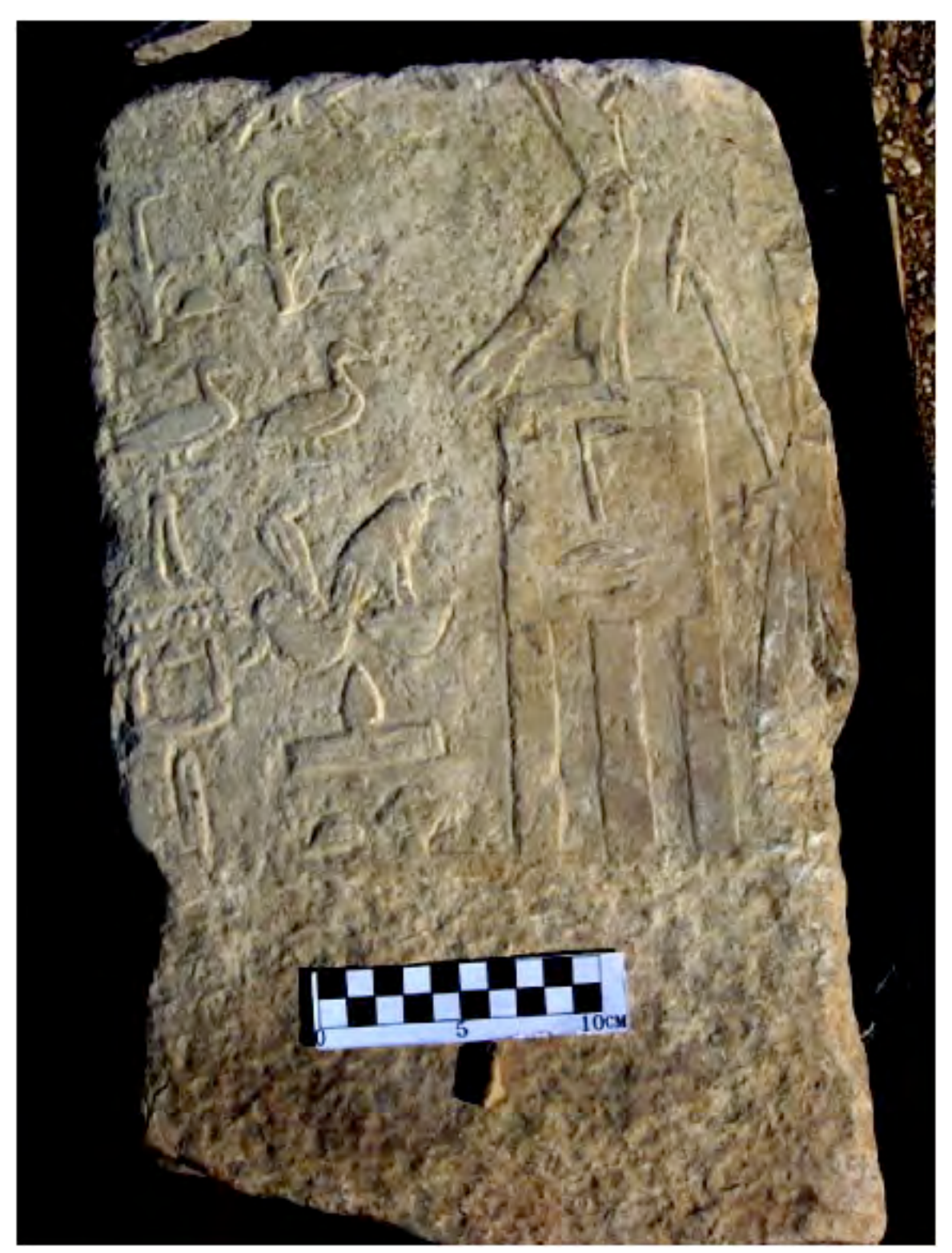
A limestone block mentioning the daughter's of Djoser and the name of the king himself (Photo: Property of SCA).

Space requirements often force the CyberScribe to leave out wonderful sites and announcements...and this remains the same today. The URL addresses