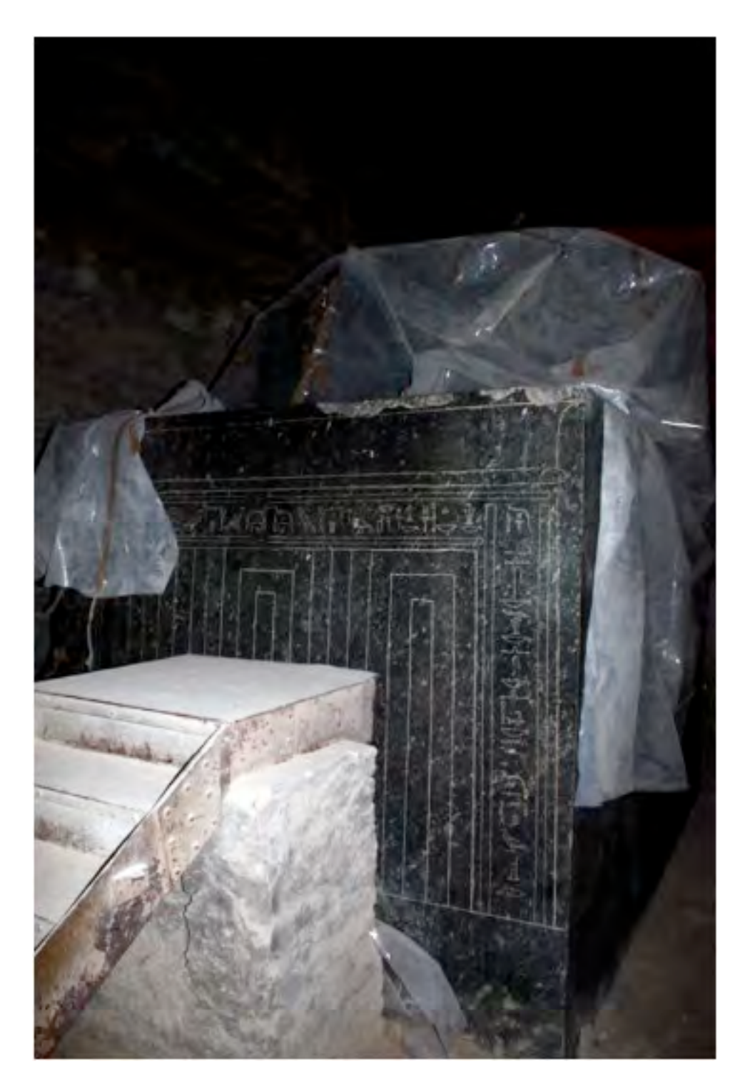
A sarcophagus that once contained the mummy of a sacred Apis bull.

"The tunnels are now being reinforced with steel archways; these act as a cage in the weakened chambers to ensure that the ceilings do not collapse. The massive stone sarcophagi are protected in wooden casings as the work continues. Standing inside the tunnels today, thin tubes can be seen hanging from the cracks in the ceiling; these are used by the conservators to inject a