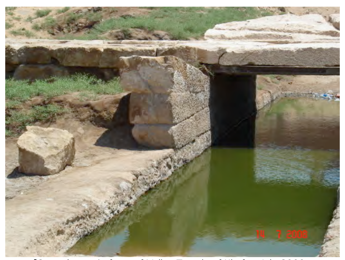
[Groundwater in front of Valley Temple of Khafre, July 2008.