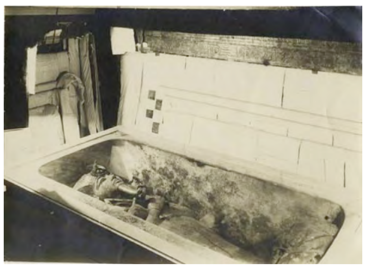
A pair of photos from the sale materials