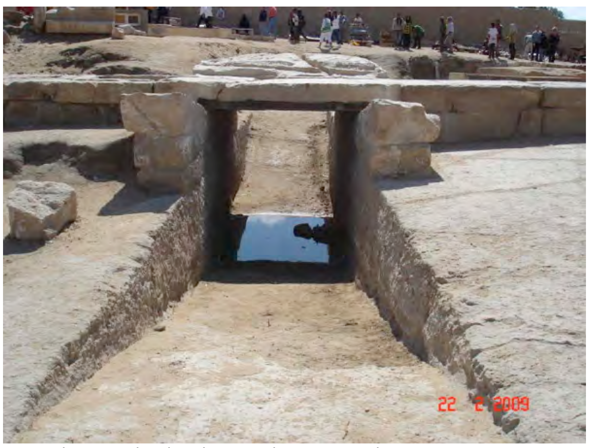
The water level in the same location in February 2009.

"We investigated lowering the water level. A horseshoe-shaped arrangement of eight pumping stations was installed in front of the statue and its temples. Every day, this system moves around 7,000 cubic meters of water, which is carried to the local drainage system.