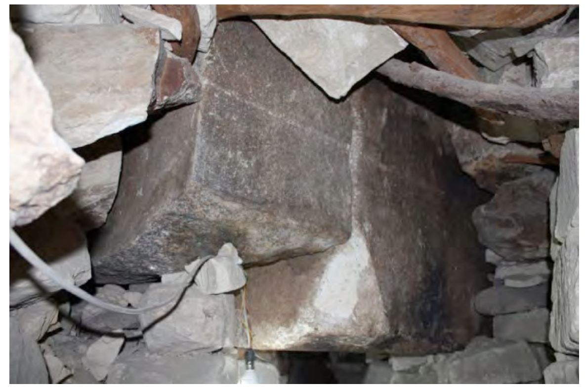
The massive sarcophagus of Djoser, which rests on six stone pillars, and is surrounded by debris.

"Exploring the substructure of the Step Pyramid is a true adventure. The passages are steep, narrow, and winding, and it is easy to become lost if you do not know your way.