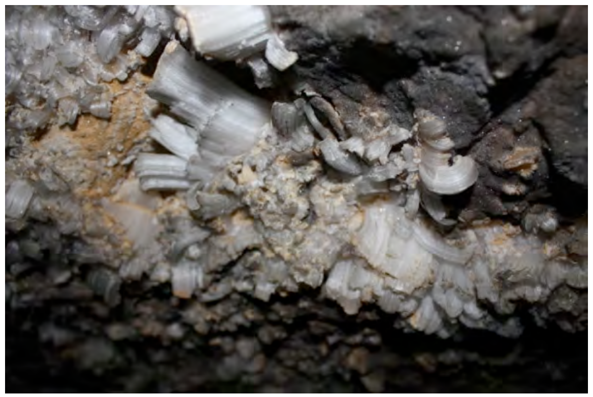
Salt crystals that have formed on a wall in the substructure of the Step Pyramid.

"Underneath the pyramid, in the maze of galleries and corridors, we are also clearing away centuries worth of debris, and working to strengthen the stone, diminishing the risk of cave-ins. This is extremely challenging work, as the rising water table has weakened the bedrock of the Saqqara plateau, and caused massive salt deposits on the walls of these underground tunnels. There are many interesting things underneath the Step Pyramid. Many of the walls were once decorated with blue faience tiles, which imitated the reed mat walls of early Egyptian buildings. Most of these tiles were stolen long ago, but some are still in their original places. There are also scenes of the king running the ritual race that renewed his power and authority during his heb-sed festival. One of the most interesting blocks that we have found under the Step Pyramid is inscribed with the serekh (a motif based on the shape of a palace building, which enclosed the name of a king) of Djoser. The name in the serekh is actually Netjerikhet - we know the king as Djoser only from sources dating to after his reign.